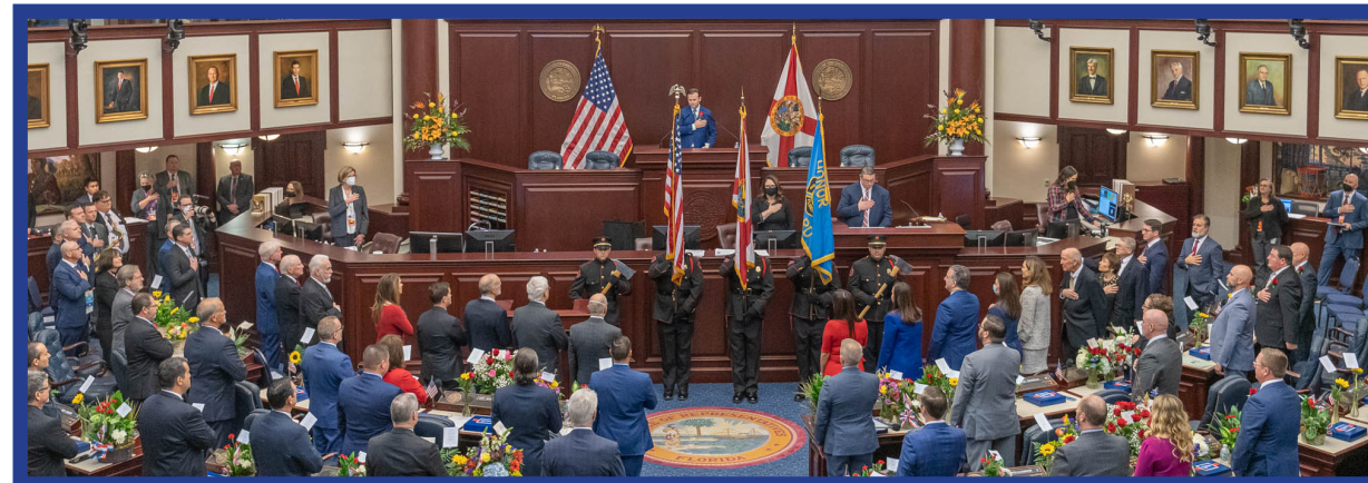
Opening Day of Session