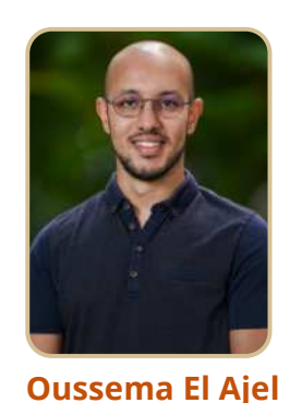
Hometown: Tunis, Tunisia Area of research interest: Shareholder activism, innovation disclosure, and antitrust. Post-doctoral plans: Secure a position at a leading research institution and contribute to the reform of Tunisia's